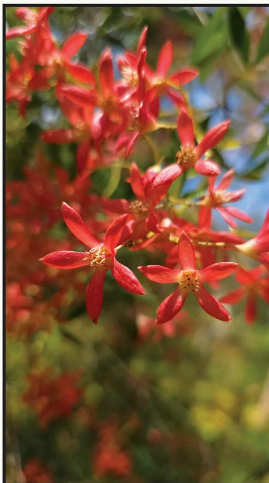
ceratopetalum gummiifera

Alternatively consider recommending our free Between the Leaves (BtL) newsletter to a family or friend so they too can be abreast of our biodynamic movement. You can subscribe on our webpage.