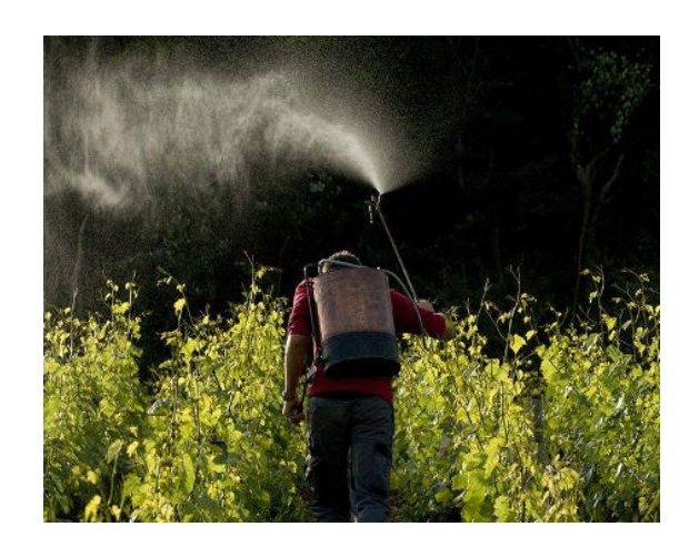
Morning atmospheric spray fine mist into the air

We recommend our Astro Calendar to support your growing, recommended spraying dates also on our website: https://biodynamics.net.au/seasonal-dates/ (can download pdf)